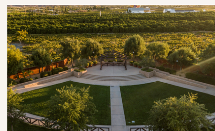
MOUNTAIN VIEW AMPITHEATER