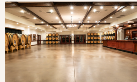
VINEYARD VIEW LOUNGE