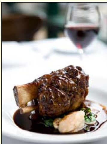
Rich meat dishes are great with Big Reds like Syrah, Cabernet or Zinfandel.

VINCENZOS'S OLIVE TREE 31712 CASINO DRIVE SUITE 3B LAKE ELSINORE, CALIFORNIA (951) 674-8941