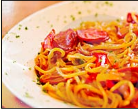
For tomato based dishes try Sangiovese or Barbera

Answer: The best way to start is to pair with foods that have some characteristic in common with the wine. For instance, if the food is high in acid and not particularly sweet, such as tomato-based dishes, choose a high-acid dry wine, perhaps Sangiovese or Barbera. Lower-acid wines like Tempranillo or Syrah would generally not pair as well with such meals, but would be better with meaty/earthy/spicy fare of more neutral acidity such as roast beef, mushrooms, or grilled meats without barbecue sauce.